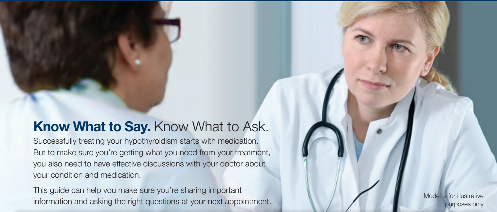
Model is for illustrative purposes only